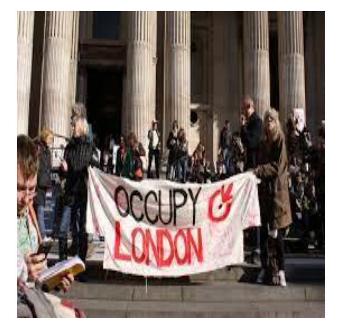
Figure 3. OCCUPY LONDON