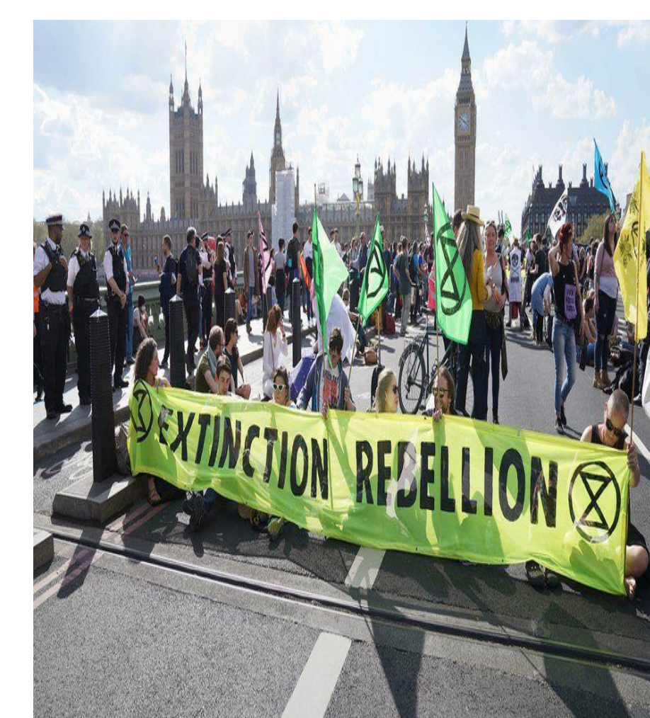
Figure 2. EXTINCTION REBELLION UK