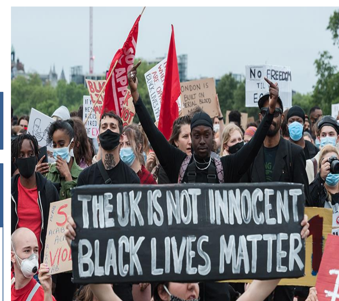
Figure 1. BLACK LIVES MATTER UK.