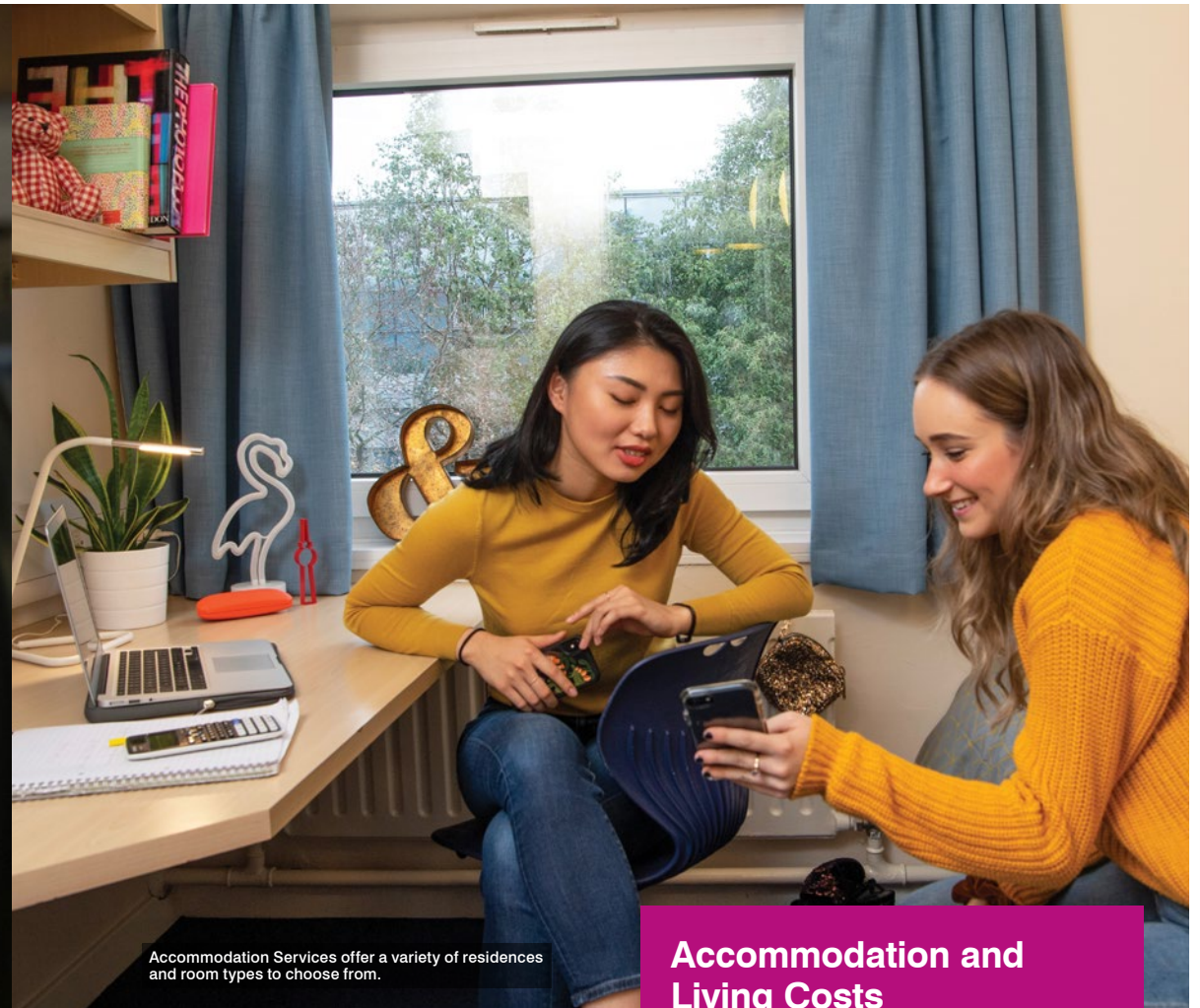
Accommodation Services offer a variety of residences and room types to choose from.