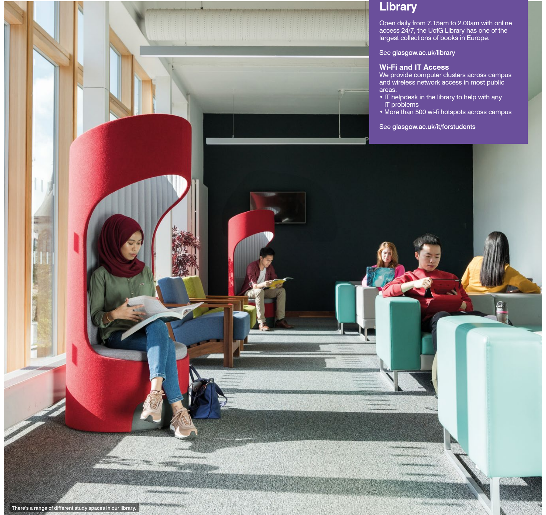
There's a range of different study spaces in our library.

See glasgow.ac.uk/international/support .