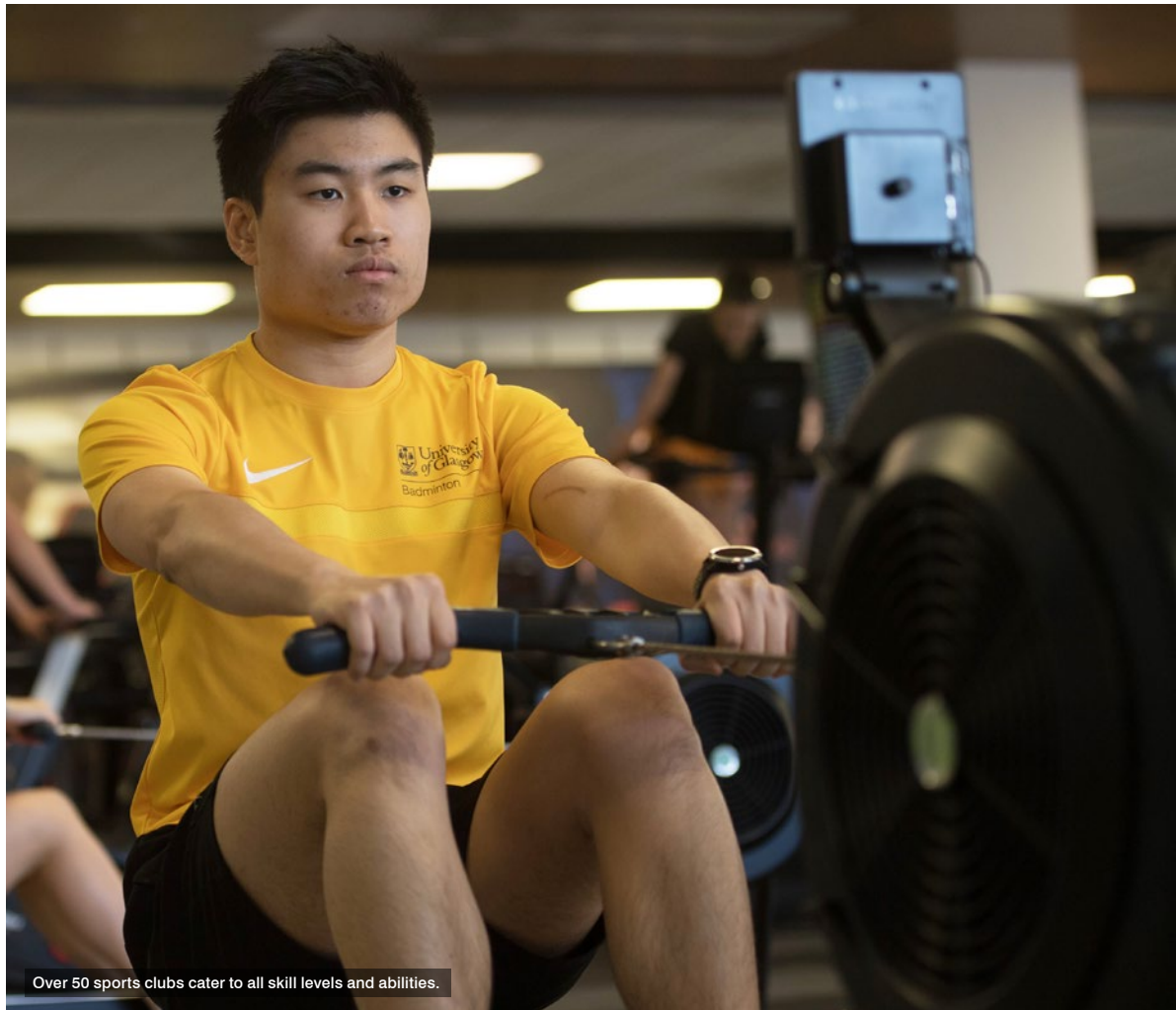
Over 50 sports clubs cater to all skill levels and abilities.