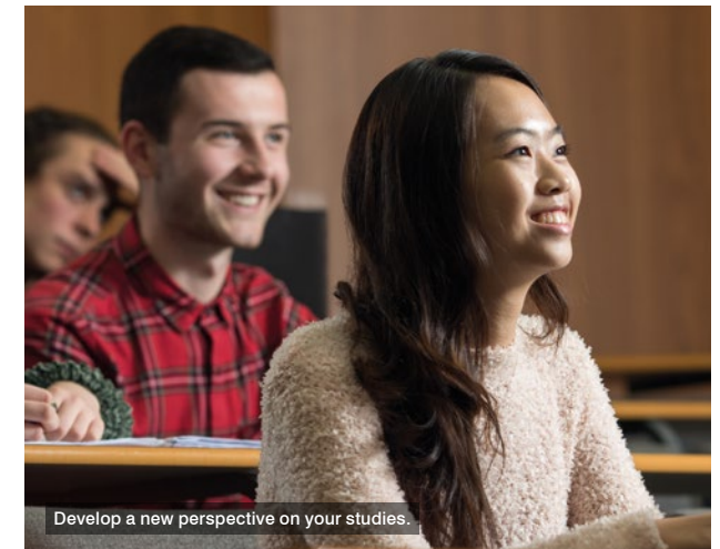
Develop a new perspective on your studies.