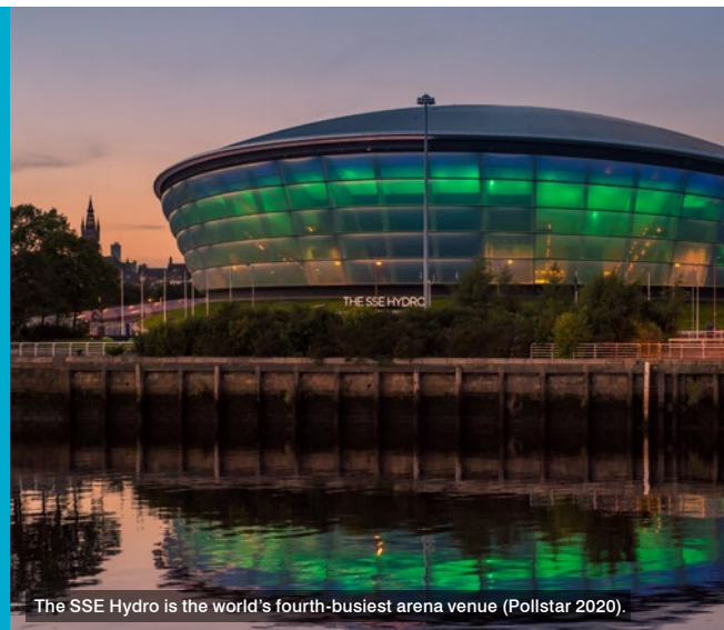
The SSE Hydro is the world's fourth-busiest arena venue (Pollstar 2020).

Glasgow has an ever-evolving food and drink scene, with options to suit all tastes and pockets. The Finnieston neighbourhood (next to the University) is considered the city's "foodie quarter" with a brilliant mix of cool, quality and affordable venues.