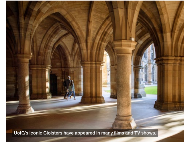
UofG's iconic Cloisters have appeared in many films and TV shows.

A range of teaching methods help you develop your skills, knowledge and experience.