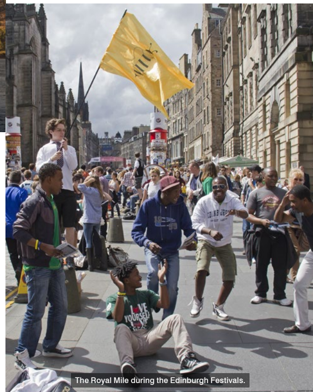
The Royal Mile during the Edinburgh Festivals.

Scotland has played a starring role on the big and small screen, as the filming location for top films and TV shows including Outlaw King , 1917 , Skyfall , Harry Potter and upcoming The Batman . In fact, the University itself is frequently used as a filming location and recently featured in several episodes of Outlander . See visitscotland.com .