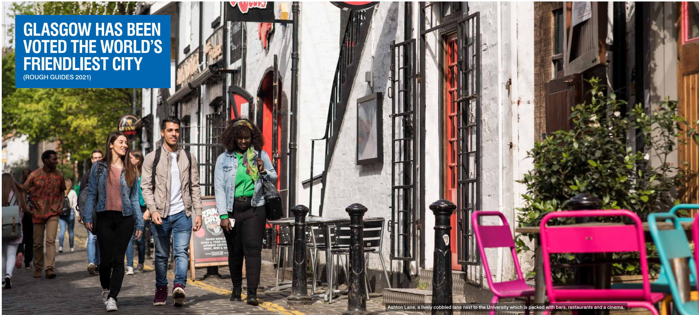
Ashton Lane, a lively cobbled lane next to the University which is packed with bars, restaurants and a cinema.