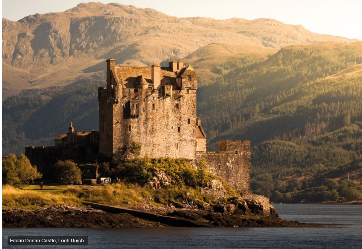
Eilean Donan Castle, Loch Dulich.