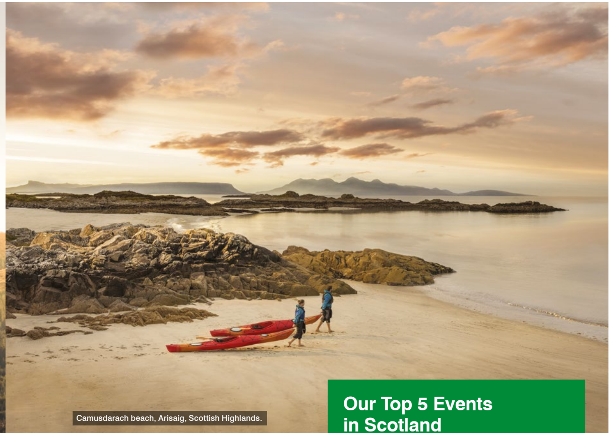
Camusdarach beach, Arisaig, Scottish Highlands.