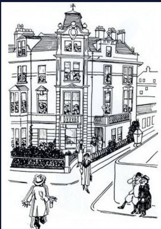
From Glasgow University Magazine 1923-1924, vol. 5, no. 9, 12 March 1924, p.259.

For a list of past speakers see: https://www.gla.ac.uk/research/az/genderhistory/news/researchseminars/