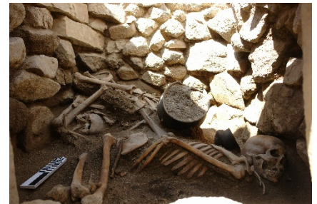
Gegharot Tomb TE2

Fundamental to the operation of the civilization machine is the definition of being and not being, a metaphysical understanding deeply shaped by the world of things. Surveying the archaeology of Early, Middle, and Late Bronze Age funerary remains in the South Caucasus, this lecture examines the integration of human bodies into the civilization machine as communities work to partition the nature of existence, map the spatial distribution of being, and define a temporal process of becoming.