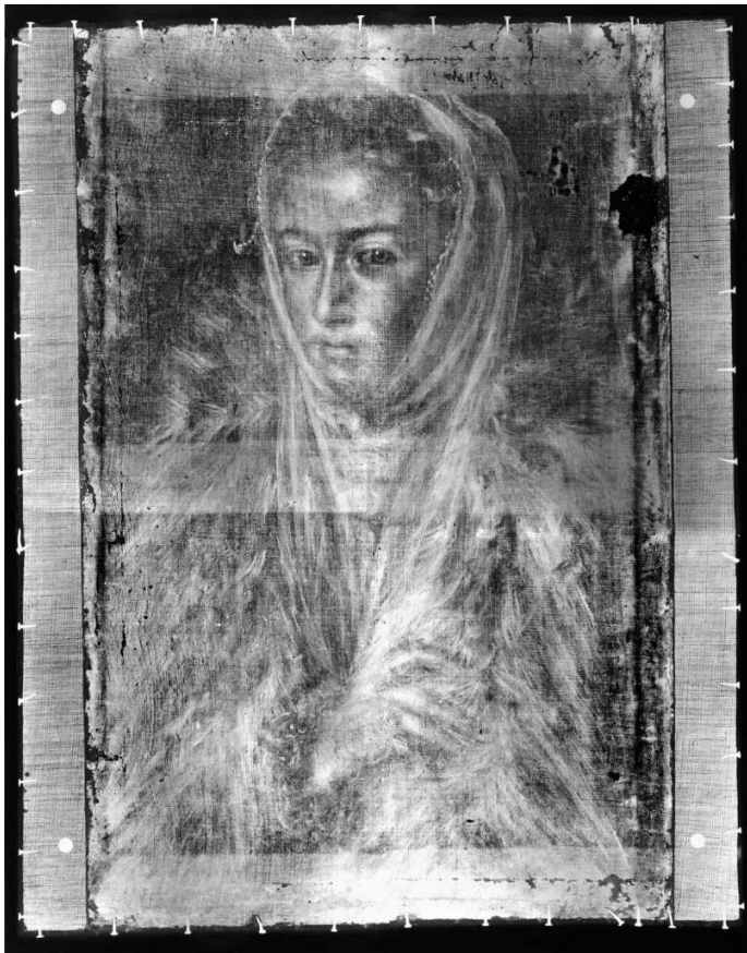
Figs. 8, 10