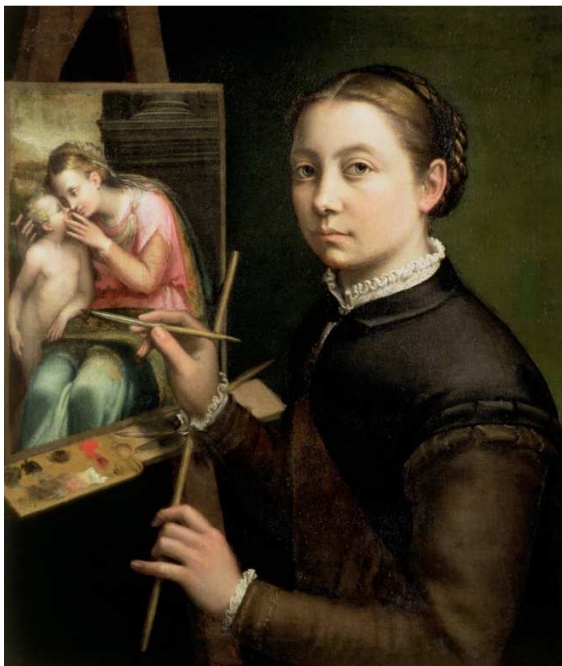
Figs. 3, 9