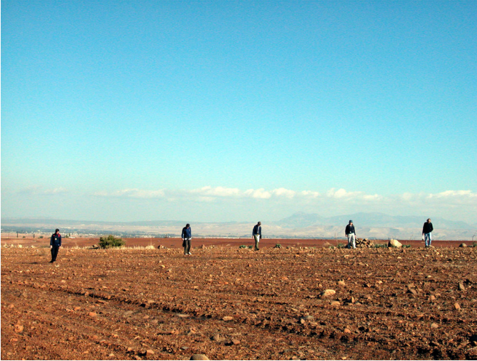
Figure 3. Fieldwalking in the Koutraphas Intensive Survey Zone

Our five transects in the November 2003 season were limited to the western part of the zone. This was partly because there was a very clear drop-off in pottery as we moved east, and partly because we wished to put into context the large amounts of Roman pottery found in our first transect (TT499000E). The ground visibility was superb (Figure 3).