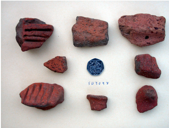
Figure 5. Sample of pottery from Nikitari Petrera