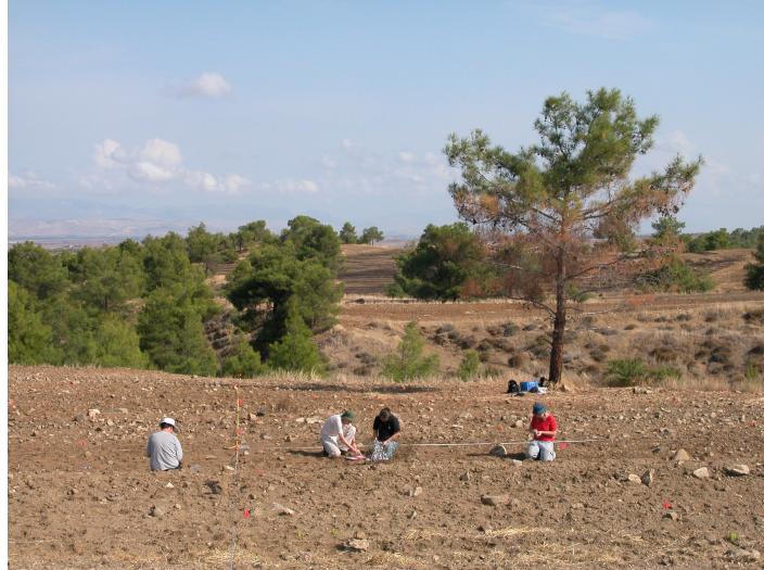
Figure 2. Gridding Kato Koutraphas Mandroudhes

Mandroudhes lies on Pleistocene alluvium, just where it joins the pillow lava of an earlier valley wall. This is a landscape far older than the Bronze Age material which lies on it. The rate of erosion has been low and disturbance through ploughing relatively benign, so the materials are still more or less in situ . A steep-sided gully bounds the eastern side of the POSI.