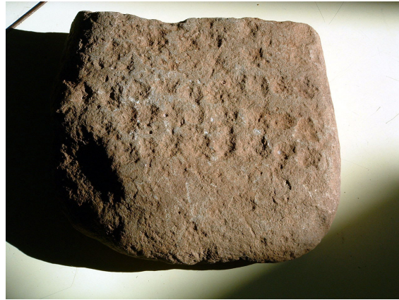
Figure 6. Senet board from Nikitari Petrera