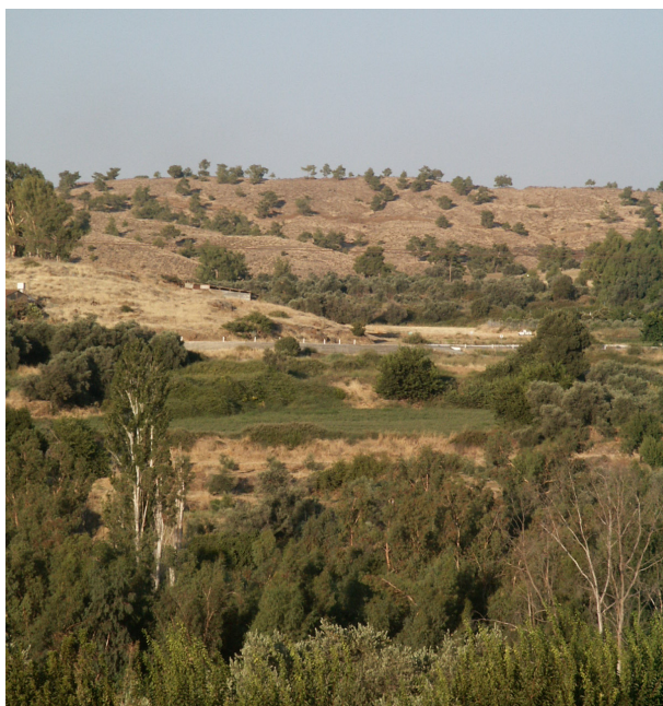
Figure 3. View from the west along Transect TT3879500N. The Late Chalcolithic and Early Bronze Age settlement of Koutroullis (TS06) is on and behind the low hill on the left.

valley produced large quantities of pottery and ground stone, as well as a little chipped stone. Several layers could be distinguished, and a possible wall was visible at the eastern end. Large amounts of similar material was visible in another bulldozed cut below the site, where old flood deposits fill an ancient river meander.