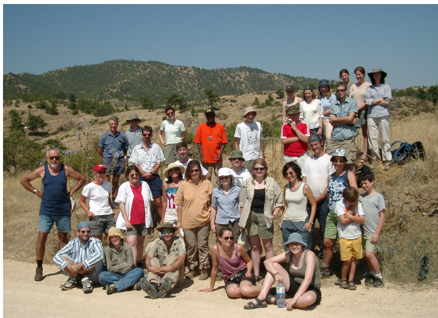
Figure 1. Part of the 2003 team during a geomorphological tour of the survey area