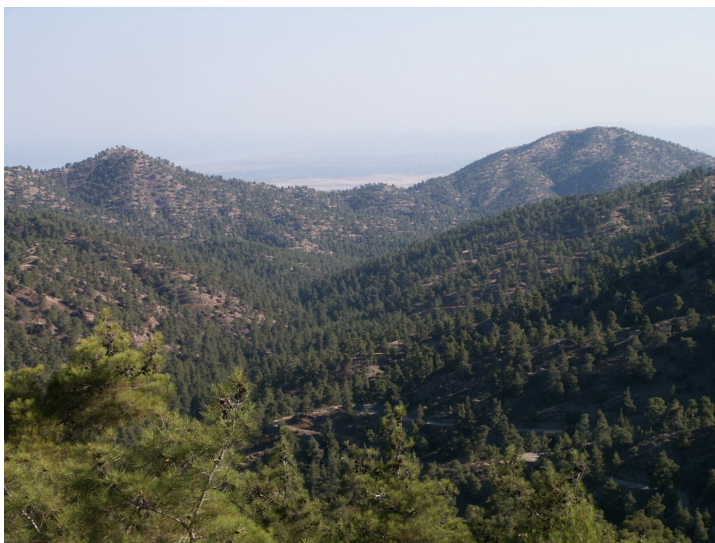
Figure 5. Looking south down Team Central's transect TT495260E. Trimitheri lies in the valley bottom just beyond the bend in the road

Team Central's other three transects extended a further 5 km up the Asinou Valley. As expected, there was little cultural material on the steep mountain slopes and ridgelines other than evidence of forest activities and hunting. The valley bottoms, by contrast, turned out to be very rich, with two out of three transects finding pottery and a range of check dams, agricultural terraces and structures. The most surprising find was a large building complex dated by its pottery to the Roman and Ottoman periods (Nikitari Trimitheri ; TP220). This consisted of at least three substantial rooms, one of them probably subdivided. The Roman pottery consisted of a cooking pot fragment, a Cypriot Red Slip rim (Form 9: second half of the sixth century AD), and a large number of tile fragments. In a later phase, probably contemporary with the Medieval-Modern pithari fragments, the northernmost room was rebuilt with two very rubbly walls. We know from oral sources of goat folds in this area, which would be in keeping with this second phase of the structure.