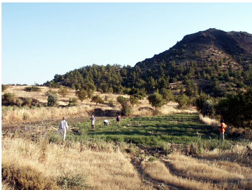
Figure 4. Team East fieldwalking at Xyliatos Litharkies, with Alestos in the background

corpus is made up of tablewares, most of these units have a relatively higher proportion of Hellenistic to Early Roman material compared to the Late Roman material. SU2605 in particular has both the Early and Late Roman material, and is notable for the wide variety of cooking wares. All the common tableware types known throughout the TAESP area are represented in this unit.