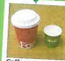
Coffee cups & lids (all common brands)