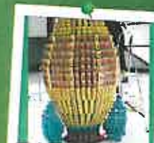
Food tins & cans