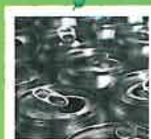
Drinks cans (steel & aluminium)