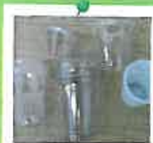
Food containers (includes yogurt pots)