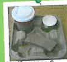
Coffee cups & holders (all common brands)