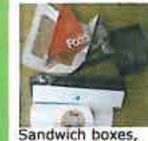
Sandwich boxes, wrap & roll sleeves