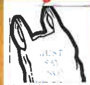
Plastic bags (recycle at supermarket)