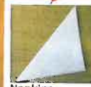
Napkins (food bin if covered in food)