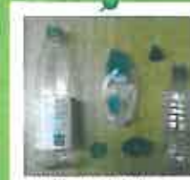
All plastic bottles and caps (includes cleaning products)