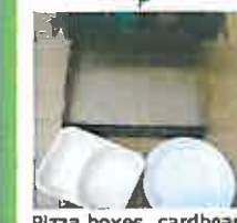
Pizza boxes, cardboard plates and containers