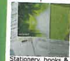
Stationery, books & envelopes

All cardboard packaging sold at University "Food" outlets can be recycled.