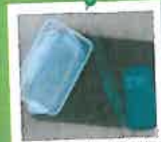
Other moulded plastics from non-food items

All moulded plastic packaging sold at University "Food" outlets can be recycled.