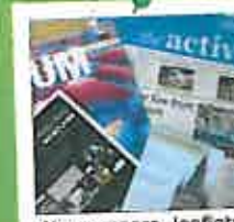
Newspapers, leaflets, magazines & flyers