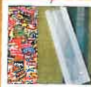
All plastic wrapping