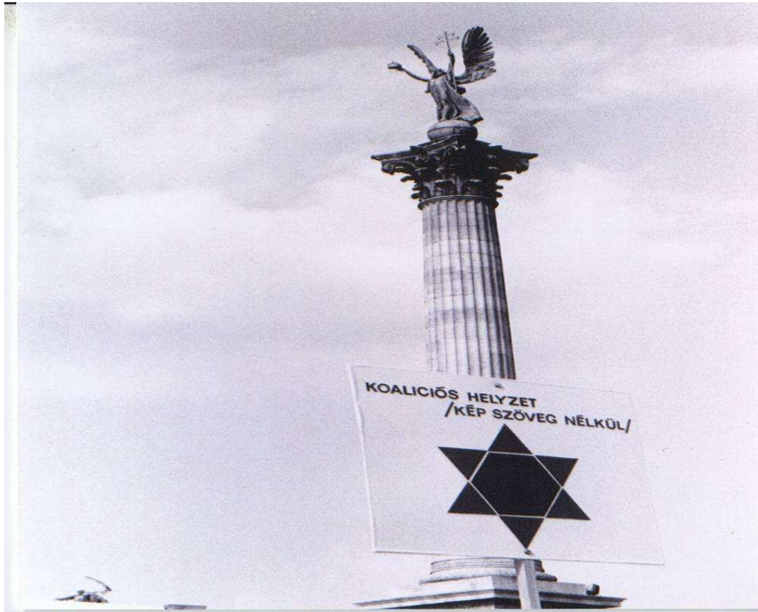
Illustration 1: Placard ‘depicting’ the composition of the Hungarian government at a Nationalist Political rally in 1997. Photograph by the author, Budapest, 15 March 1997.

Perhaps it was the most important interview I conducted. In both the formal and informal interviews I was very attentive to the relationships in which I was interested: how did the respondent feel about life since the collapse of socialism? How would the respondent characterise her political or social position before the collapse? What were the respondent’s thoughts on liberalism as a political or social project, and what did she think of capitalism as an economic project? What forces does she believe are directing politics, domestically or internationally? What are the significant markers in both the respondent’s personal life and those in Hungary’s history? I found it important to give the respondent as much room as possible in which to navigate these tricky topics. I also found it important not to prompt any responses, as pre-determined categories would limit the