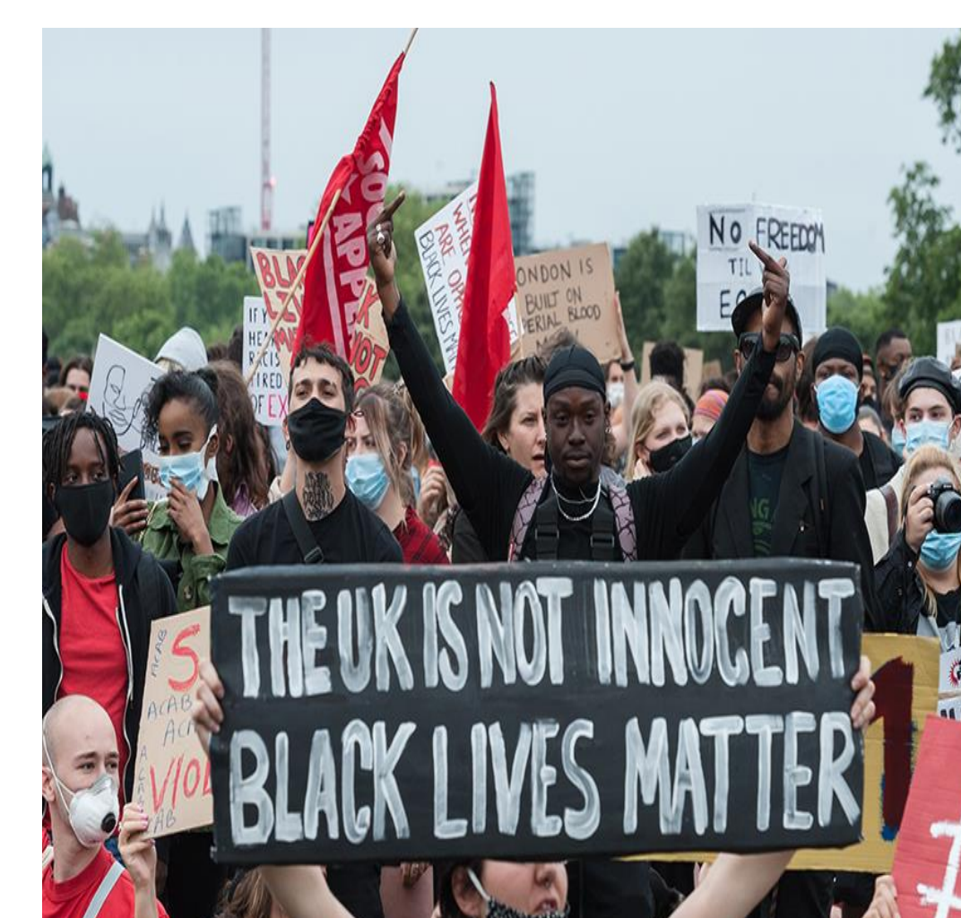
Figure 1. BLACK LIVES MATTER UK.