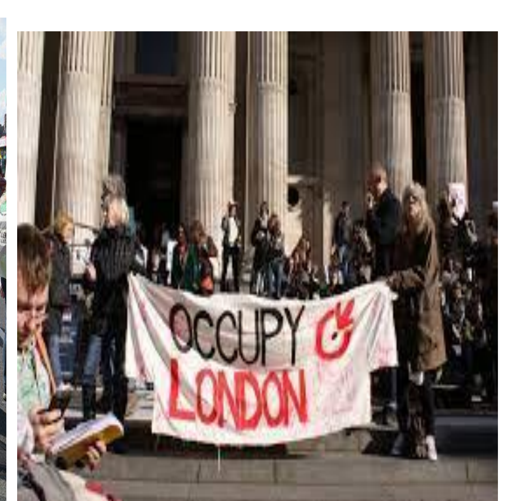
Figure 3. OCCUPY LONDON